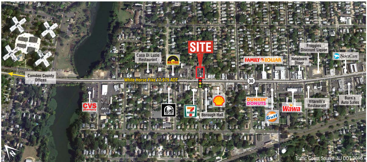
Traffic Count Source: NJ DOT 2016